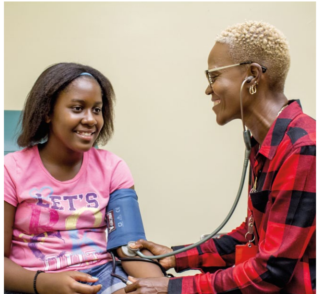
A UI Health nurse delivers culturally responsive care