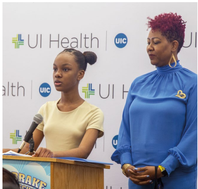
Drake student and principal at a HEAL press conference