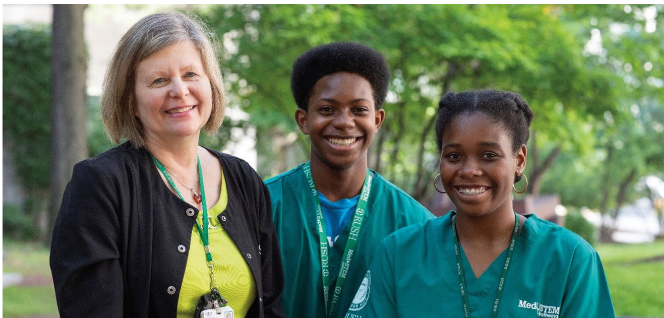
Rush Host Preceptor with MedSTEM HS Interns