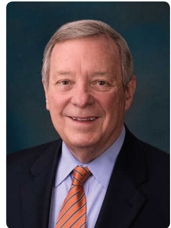
U.S. Senator Dick Durbin

Since then, these hospitals have weathered the COVID-19 pandemic and its financial reckoning, experienced the turnover of several executives, and seen the toll of gun violence rise over the years. But we remained undeterred in our commitment to use community-based work to address the trauma and economic disinvestment that fuels the shootings.