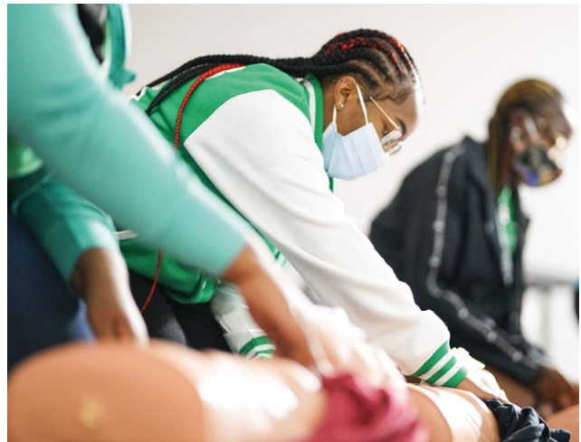
Rush MedSTEM pre-interns in CPR Certification class

systems, especially the retention of frontline employees, and will assess additional opportunities for HEAL health systems to collaborate with major local workforce development initiatives, such as the Chicagoland Healthcare Workforce Collaborative and the Corporate Coalition, which seek to provide inclusive employment accessibility for unemployed and underemployed individuals.