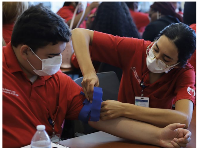
Lurie Children's hosts "Discovering Healthcare Careers"