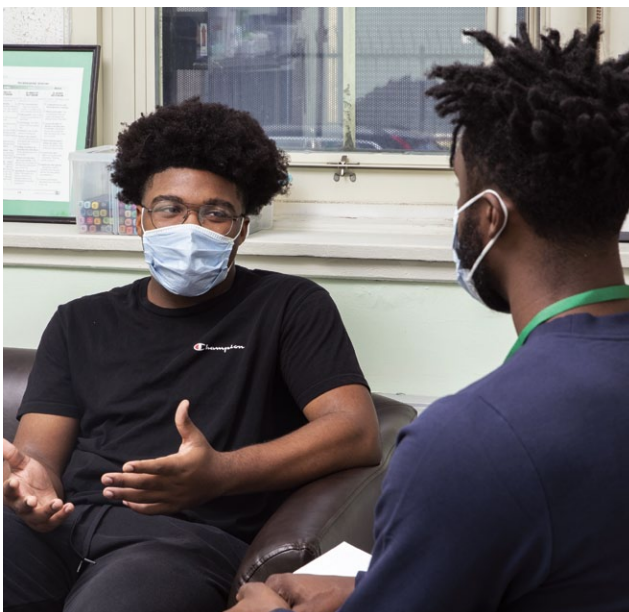
Access to adolescent-centric counseling in the Rush SBHC at Crane Medical Prep High School