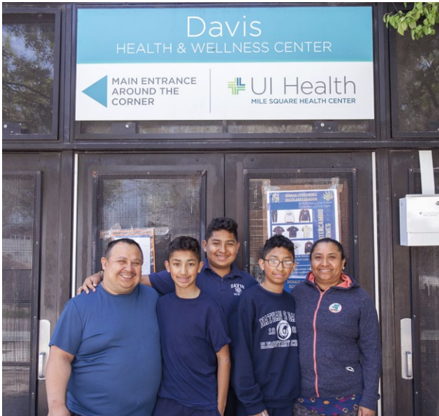
A family receiving care at UI Health Mile Square - Davis